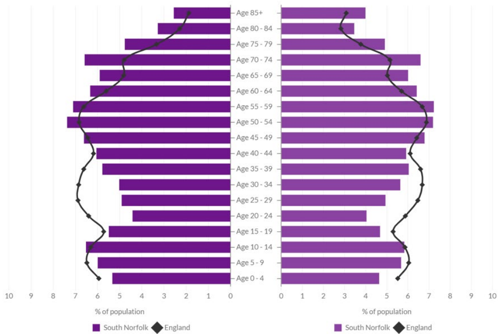
The population of South Norfolk broken down by age bracket.

5.4 Population data for the District shows that 24.4% of residents are at least 65 years old (2021 Census). It is therefore anticipated that greater pressure will be exerted on health, medical and social care services over the course of the Plan period as the population continues to age. Census data records that within South Norfolk district 10.5% of residents have their activities limited a little by their health and 7.4% limited a lot by their health (Census 2021).